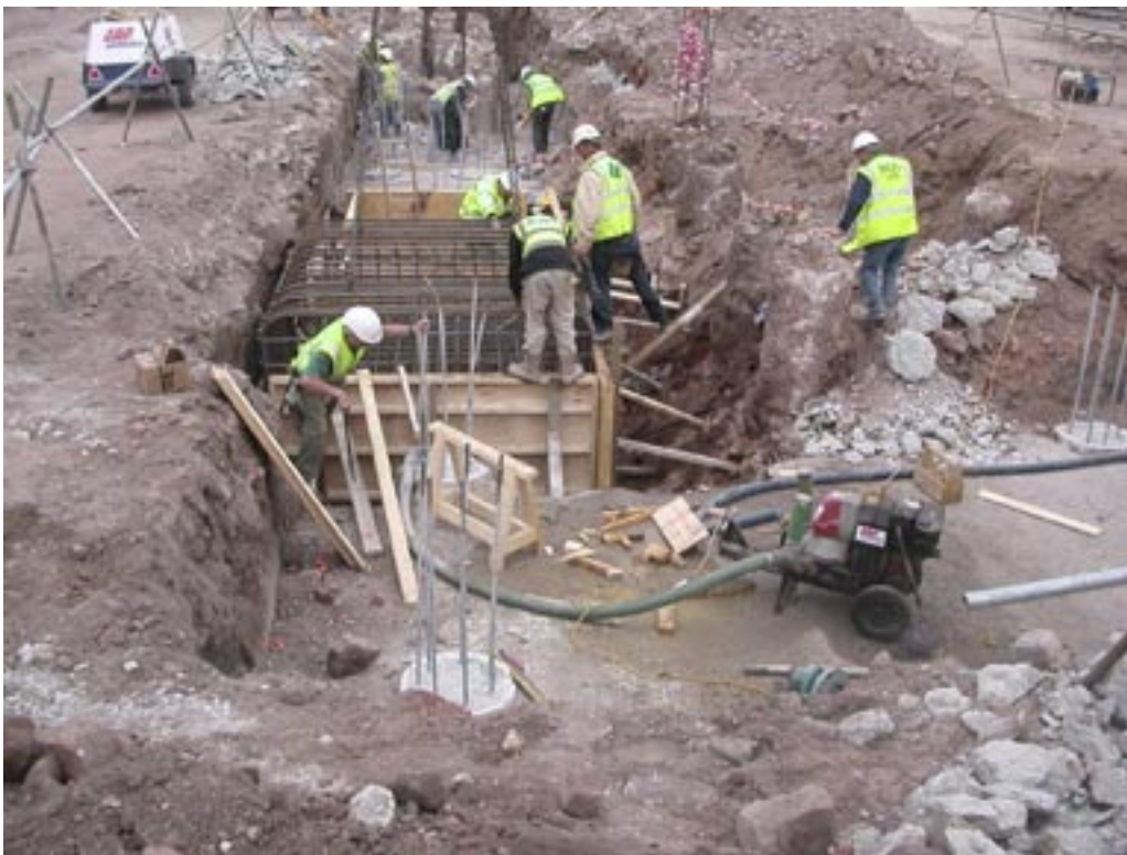
Poor site preparation for pile testing